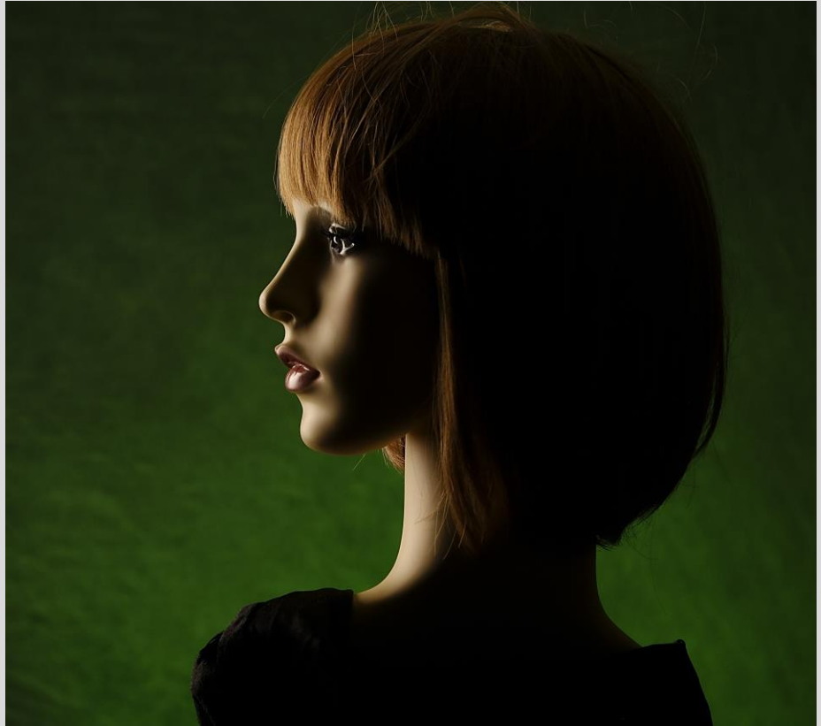
Using a green filter on the back light