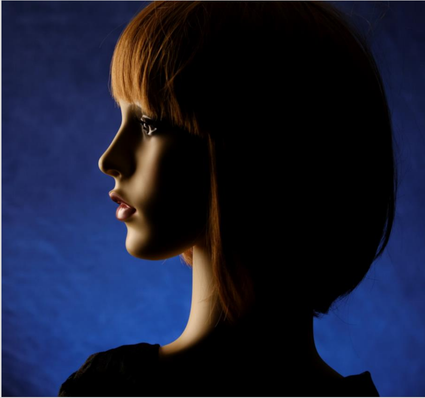
Using a blue filter on the back light