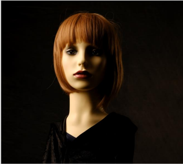
1. Back light very low