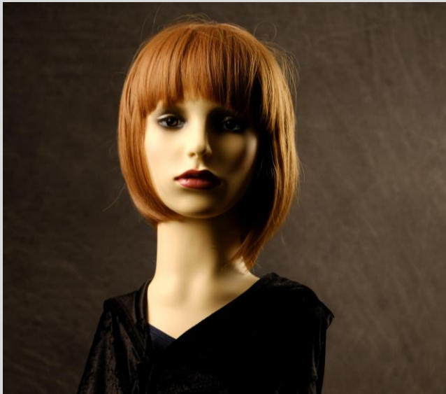
Back light increased & angled slightly to backdrop