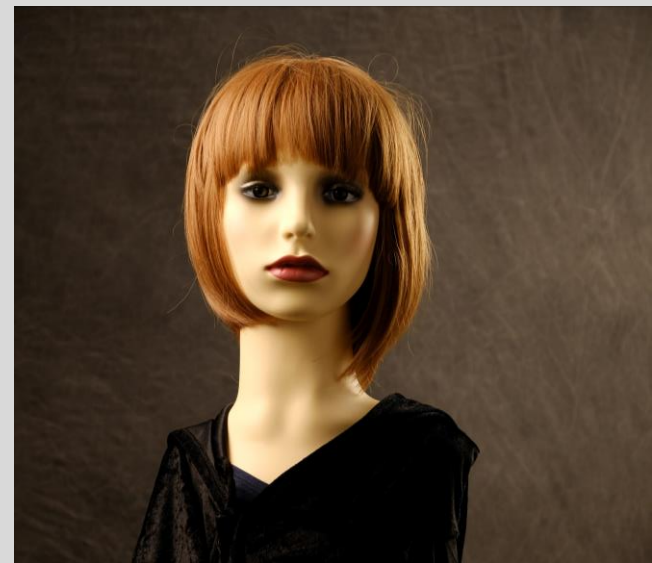
Adding white reflector fills in shadows