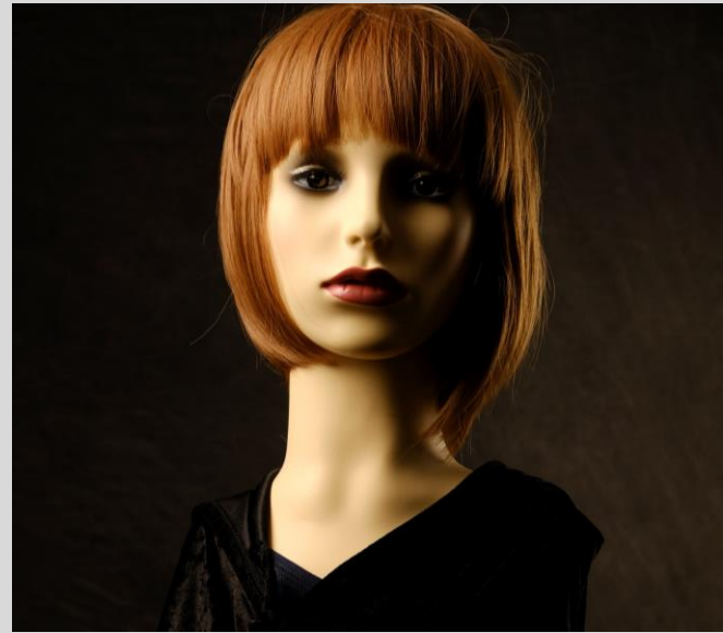
2. Back light brighter